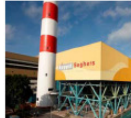
Tuas Waste to Energy DBOO Plant