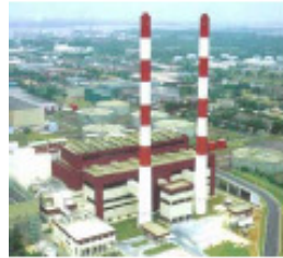
Senoko Waste to Energy Plant