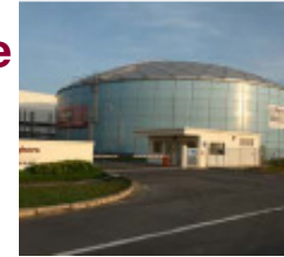
Ulu Pandan NEWater Plant